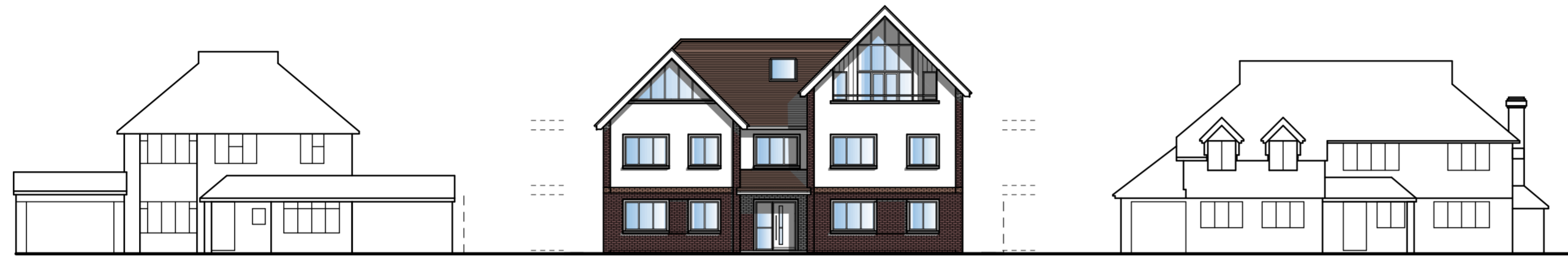
VIEW FROM THE RIDGE WAY