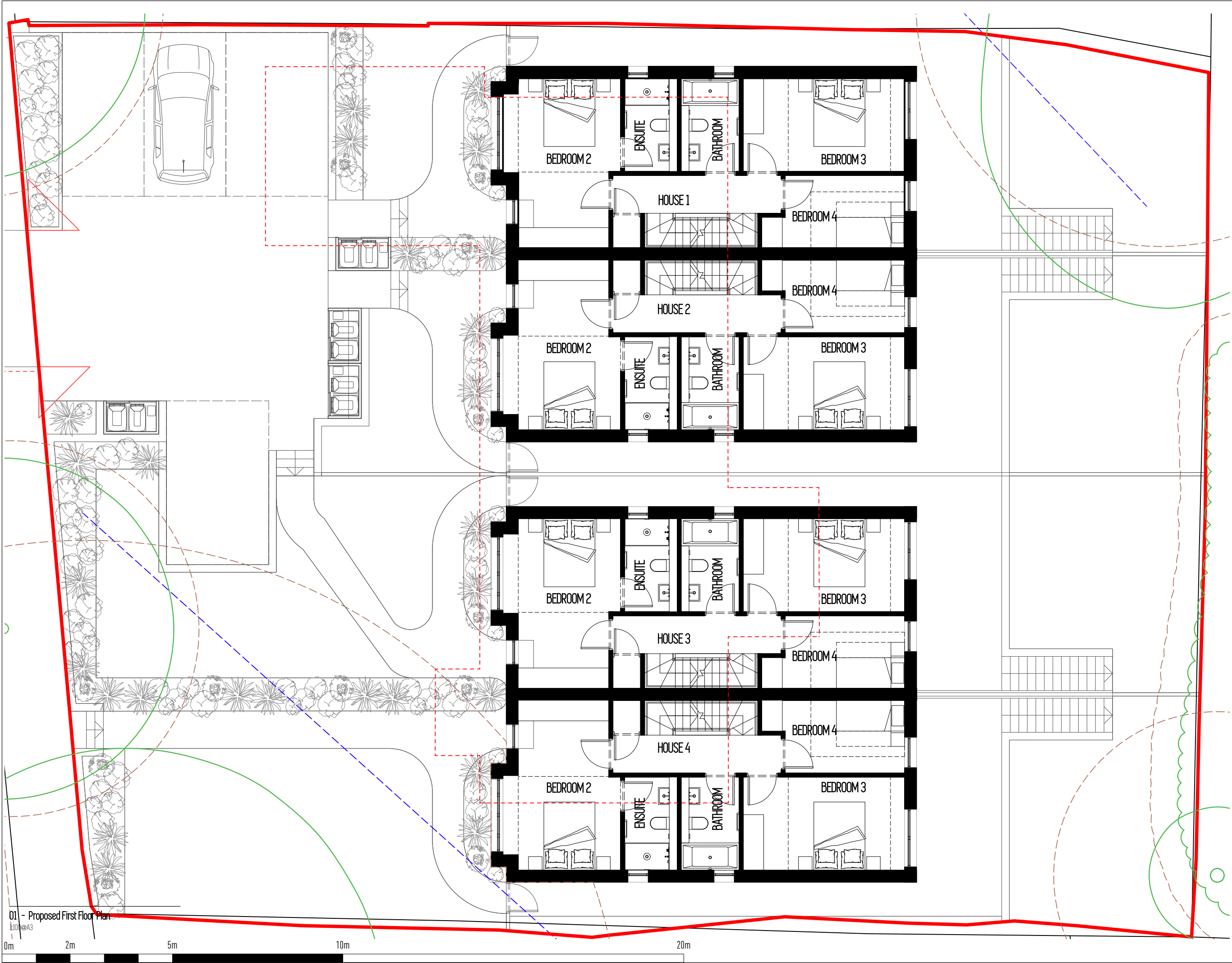
01 - Proposed First Floor Plan 1:100@A3