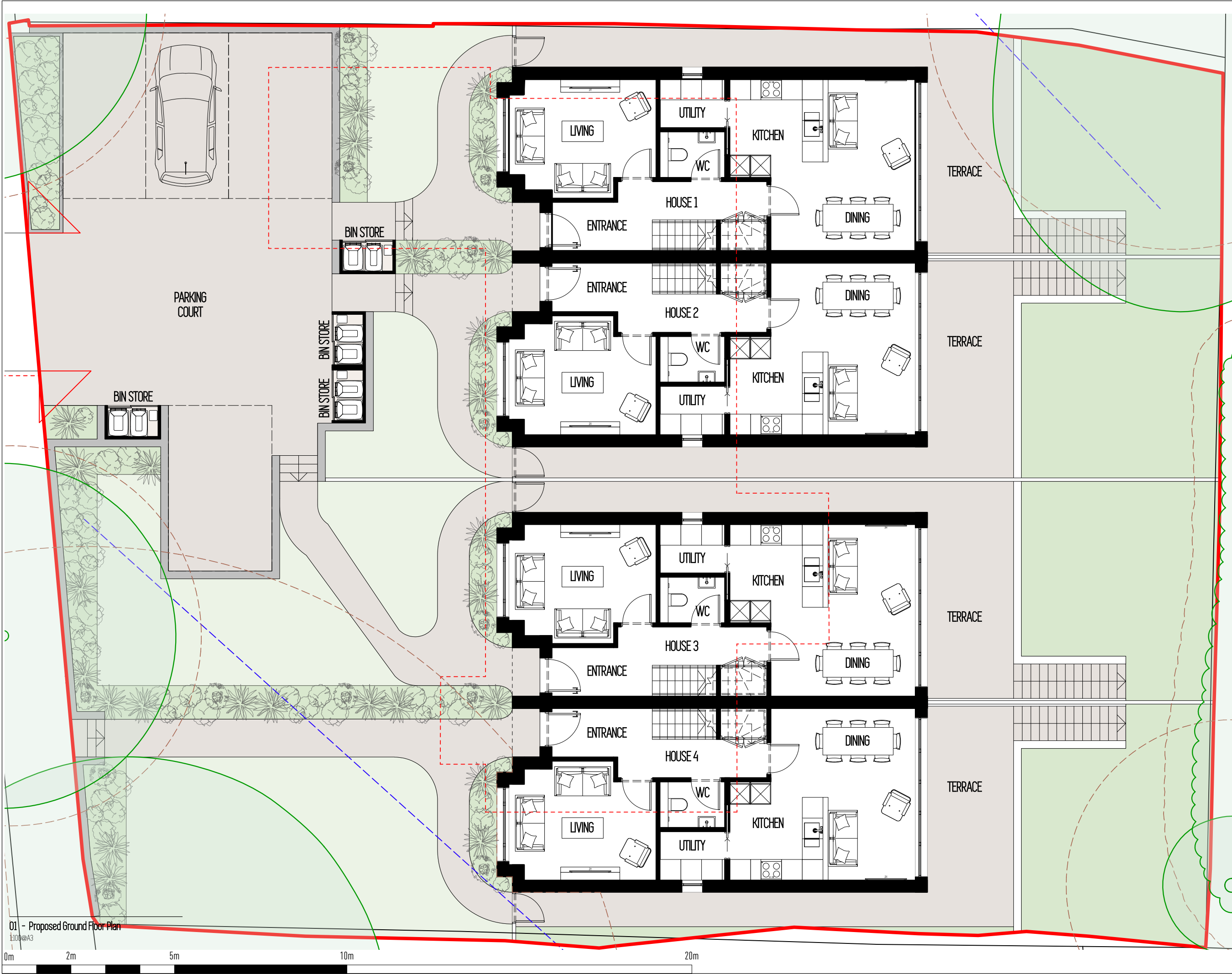
01 - Proposed Ground Floor Plan 1:100@A3

Status: Pre-app Drawn: DL Checked: DL Scale: 1:100@A3 Date: Mar 2021 Revision: Drawing Number: 027-GA00